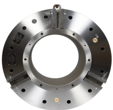
Big Mouth Air Chucks