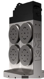
Tombstones, Trunnions, Indexers